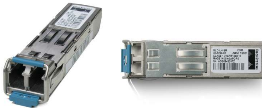
Figure 1. Gigabit Ethernet SFP

The industry-standard Cisco® Small Form-Factor Pluggable (SFP) Gigabit Interface Converter is a hot-swappable input/output device that plugs into a Gigabit Ethernet port or slot, linking the port with the network (Figure 1). SFPs can be used and interchanged on a wide variety of Cisco products and can be intermixed in combinations of 1000BASE-SX, 1000BASE-LX/LH, 1000BASE-ZX, or 1000BASE-BX10-D/U on a port-by-port basis.