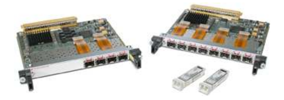
Figure 1. Cisco 4-Port and 8-Port OC-3c/STM-1 POS SPAs

The Cisco<sup>®</sup> I-Flex design combines shared port adapters (SPAs) and SPA interface processors (SIPs), using an extensible design that enables service prioritization for voice, video, and data services. Enterprise and service provider customers can use improved slot economics resulting from modular port adapters are interchangeable across Cisco routing platforms. The I-Flex design maximizes connectivity options and offers superior service intelligence through programmable interface processors, which deliver line-rate performance. I-Flex enhances speed-to-service revenue and provides a rich set of quality-of-service (QoS) features for premium service delivery while effectively reducing the overall cost of ownership. This data sheet contains the specifications for the Cisco 4/8-Port OC-3c/STM-1 Packet over SONET SPAs (Cisco 4/8-Port OC-3 POS SPAs; refer to Figure 1).