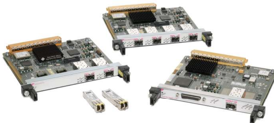
Figure 1. Cisco 2-Port OC-48c/STM-16c POS/RPR SPA with SFP Optics

The Cisco 1-, 2-, and 4-Port OC-48c/STM-16c POS/RPR SPAs are available on high-end Cisco routing platforms and offers the benefits of network scalability with lower initial costs and easy upgrades. The SPAs continues the Cisco focus on investment protection along with consistent feature support, broad interface availability, and leading-edge technology. The SPAs allow different interfaces (POS, ATM, etc.) to be deployed on the same carrier card.