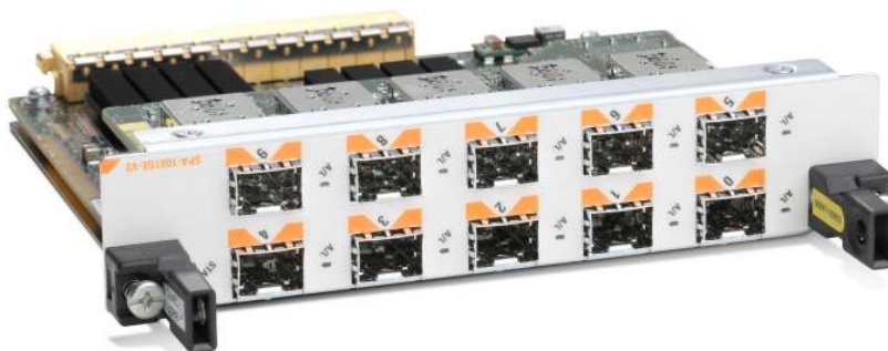
Figure 1. Cisco 10-Port Gigabit Ethernet SPA

The Cisco® Interface Flexibility (I-Flex) design combines shared port adapters (SPAs) and SPA interface processors (SIPs), taking advantage of an extensible design that helps enable service prioritization for voice, video, and data services. Enterprise and service provider customers can take advantage of improved slot economics resulting from modular port adapters that are interchangeable across Cisco routing platforms. The Cisco I-Flex design maximizes connectivity options and offers superior service intelligence through programmable interface processors that deliver line-rate performance. Cisco I-Flex enhances speed-to-service revenue and provides a rich set of quality of service (QoS) features for premium service delivery while effectively reducing the overall cost of ownership. This data sheet contains the specifications for the Cisco 2-, 5-, 8-, and 10-Port Gigabit Ethernet Shared Port Adapters, Version 2 (Figures 1, 2, and 3).