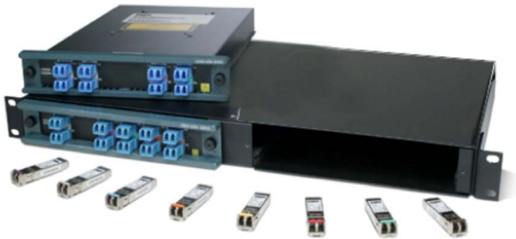
Figure 10. Cisco CWDM Extended Distance SFP Solution

The Cisco CWDM SFP solution enables the transport of up to eight channels over one pair of single-mode fiber strands, enabling enterprises to increase the bandwidth of an existing optical infrastructure without adding new fiber strands. The solution can be used in parallel with other Cisco SFP devices on the same platform.