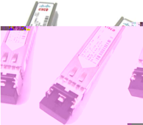
Figure 2. Cisco 4-Gbps Fibre Channel SFPs