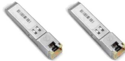
Figure 6. Cisco Copper Gigabit Ethernet SFP

To enable even more cabling flexibility, the Cisco MDS 9000 family offers a copper Gigabit Ethernet SFP. Based on the 1000BASE-T standard, the Cisco Copper Gigabit Ethernet SFP (Figure 5) provides cost-effective connectivity for data center applications. The Cisco Copper Gigabit Ethernet SFP (part number DS-SFP-GE-T) allows a user to use standard Category-5 unshielded twisted pair (UTP) cabling for Ethernet connectivity.