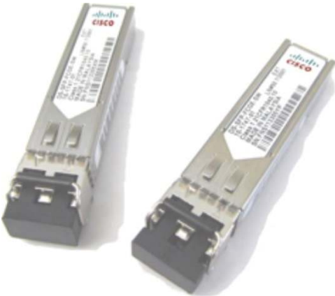
Figure 1. Cisco 2-Gbps Fibre Channel SFPs

The Cisco 2-Gbps Fibre Channel SFPs (Figure 1) are designed to provide cost-effective Fibre Channel connectivity for the Cisco MDS 9000 Fibre Channel switching modules. Two types of Cisco 2-Gbps Fibre Channel SFP are available: the Cisco Fibre Channel Shortwave SFP (part number DS-SFP-FC-2G-SW) and the Cisco Fibre Channel Longwave SFP (part number DS-SFP-FC-2G-LW). Each product offers 1/2-Gbps autosensing Fibre Channel connectivity.