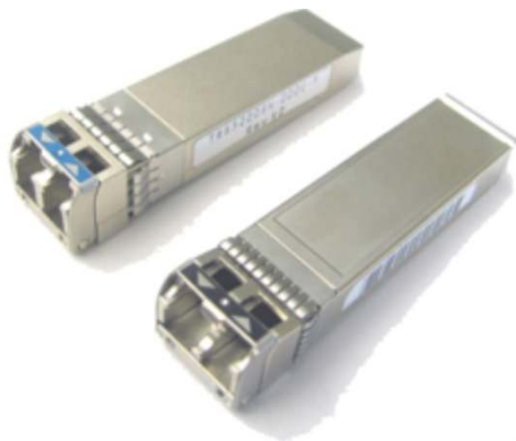
Figure 3. Cisco 8-Gbps Fibre Channel SFP+