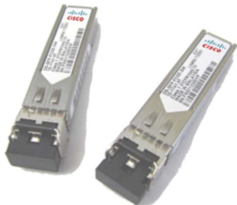
Figure 5. Cisco Tri-Rate Multiprotocol SFPs

There are two types of Cisco Tri-Rate Multiprotocol SFP (Figure 4): the Cisco Tri-Rate Multiprotocol Shortwave SFP (part number DS-SFP-FCGE-SW) and the Cisco Tri-Rate Multiprotocol Longwave SFP (part number DS-SFP-FCGE-LW). Each product offers autosensing 1/2-Gbps Fibre Channel connectivity and 1-Gbps Ethernet connectivity.