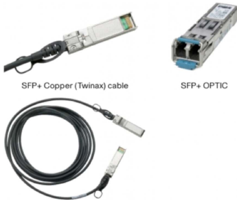
Figure 4. Cisco 10GBASE SFP+ Modules