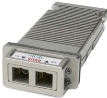
Figure 8. Cisco 10-Gbps Fibre Channel CX4 X2 Transceiver (Part Number DS-X2-FC10G-CX4)