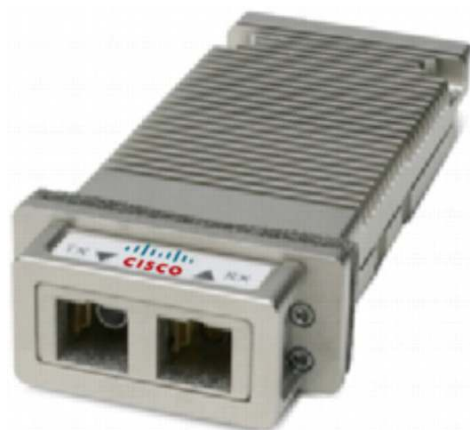
Figure 9. Cisco 10-Gbps Ethernet X2 Transceiver

The Cisco Ethernet X2 Transceiver Short Reach (up to 300 m; part number DS-X2-E10G-SR) enables high-performance Fibre Channel connectivity for the Cisco MDS 9000 family 10-Gbps Fibre Channel switching module to an existing Ethernet Dense Wavelength-Division Multiplexing (DWDM) transponder (Figure 8). The data format transmitted by the Ethernet X2 transceiver (DS-X2-E10G-SR) onto the fiber is identical to that transmitted by the Fibre Channel transceiver (DS-X2-FC10G-SR), except that the Fibre Channel packets are clocked at the 10 gigabit Ethernet rate, which allows Fibre Channel packets to be carried over an existing 10-Gbps Ethernet DWDM infrastructure. The Cisco MDS 9000 family 10-Gbps Fibre Channel switching module will automatically detect DS-X2-E10G-SR; no software configuration is required.