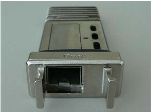
Figure 1. Cisco OneX Converter Module

The Cisco® OneX Converter Module (Figure 1) offers investment protection for 10 Gigabit Ethernet X2 ports of Cisco switches by enabling migration from X2 to Small Form-Factor Pluggable Plus (SFP+) form factor without having to upgrade the switches or modules.