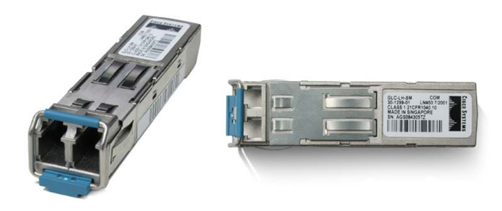
Figure 1. Gigabit Ethernet SFP

The industry-standard Cisco<sup>®</sup> Small Form-Factor Pluggable (SFP) Gigabit Interface Converter is a hot-swappable input/output device that plugs into a Gigabit Ethernet port or slot, linking the port with the network (Figure 1). SFPs can be used and interchanged on a wide variety of Cisco products and can be intermixed in combinations of 1000BASE-SX, 1000BASE-LX/LH, 1000BASE-ZX, or 1000BASE-BX10-D/U on a port-by-port basis.