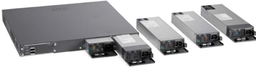
Figure 3. 2960-XR Family Power Supply