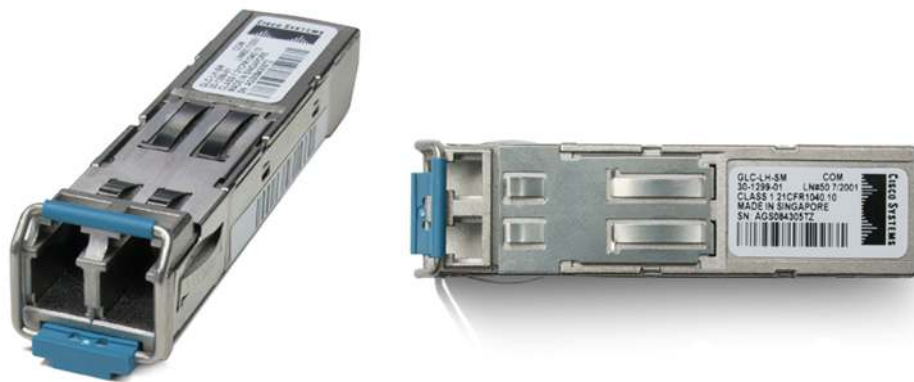
Figure 1. Gigabit Ethernet SFP

The industry-standard Cisco® Small Form-Factor Pluggable (SFP) Gigabit Interface Converter is a hot-swappable input/output device that plugs into a Gigabit Ethernet port or slot, linking the port with the network (Figure 1). SFPs can be used and interchanged on a wide variety of Cisco products and can be intermixed in combinations of 1000BASE-SX, 1000BASE-LX/LH, 1000BASE-ZX, or 1000BASE-BX10-D/U on a port-by-port basis.