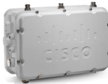
Figure 1. Cisco Aironet 1524

The Cisco Aironet 1524 is preconfigured with three radios compliant with IEEE 802.11a, 802.11b/g and 4.9GHz public safety standards. Various uplink connectivity options are supported such as Gigabit Ethernet (10/100/1000BaseT), and small form-factor pluggable (SFP) for fiber interface. Power options supported include 480VAC, 12VDC, Power over Ethernet (POE), and internal battery backup. It also employs Cisco's Adaptive Wireless Path Protocol (AWPP) to form a dynamic wireless mesh network between remote access points, while delivering secure, high-capacity wireless access to any Wi-Fi-compliant client device (Figure 2).