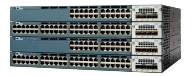
Figure 2. Cisco Catalyst 3560-X Series Switches

Table 2 shows the Cisco Catalyst 3560-X Series configurations.