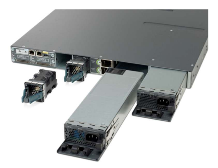
Figure 5. Dual Redundant Power Supplies

Table 6 shows the different power supplies available in these switches and available PoE power.