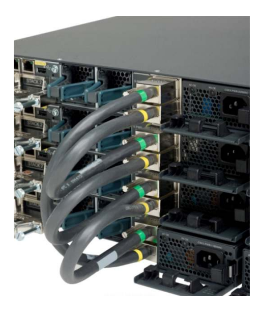
Figure 3. StackPower Connector

StackPower can be deployed in either power sharing mode or redundancy mode. In power sharing mode, the power of all the power supplies in the stack is aggregated and distributed among the switches in the stack. In redundant mode, when the total power budget of the stack is calculated, the wattage of the largest power supply is not included. That power is held in reserve and used to maintain power to switches and attached devices when one power supply fails, enabling the network to operate without interruption. Following the failure of one power supply, the StackPower mode becomes power sharing.