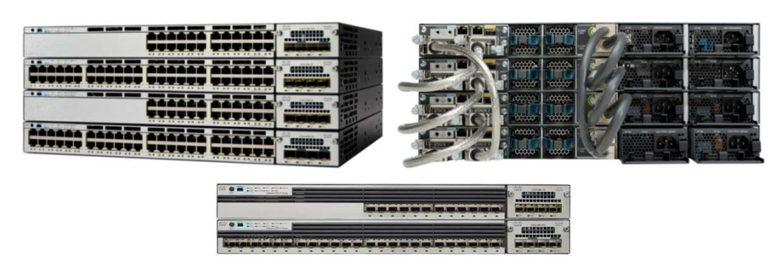
Figure 1. Cisco Catalyst 3750-X Series Switches (Front and Back)

Table 1 shows the Cisco Catalyst 3750-X Series configurations.