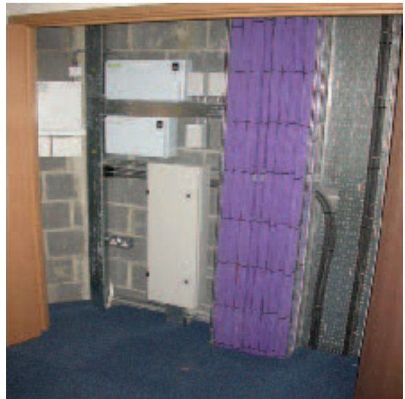
Data cable in tray with power cable running diagonally across the room.

So screening performance can be defined and measured, but what is the limiting factor, below which a cable couldn't be described as screened is not defined. Cable armour is considered as part of the protective earth circuit.