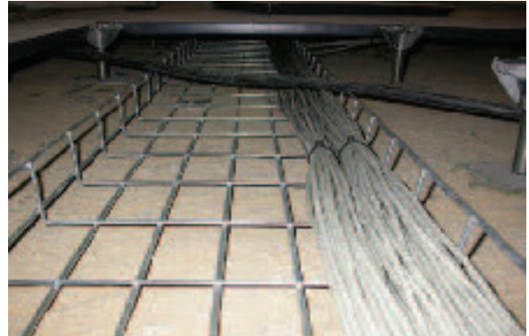
Data cable in tray with power cable running diagonally across the room.

"Two important properties in characterising screening effectiveness of cables are transfer impedance and capacitive coupling (admittance and impedance). These properties can be used to calculate the normalised screening attenuation in dB."