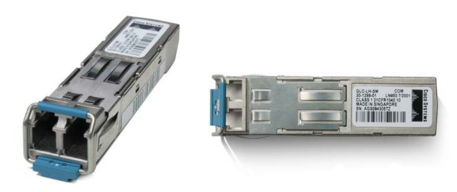
Figure 1. Gigabit Ethernet SFP

The industry-standard Cisco<sup>®</sup> Small Form-Factor Pluggable (SFP) Gigabit Interface Converter is a hot-swappable input/output device that plugs into a Gigabit Ethernet port or slot, linking the port with the network (Figure 1). SFPs can be used and interchanged on a wide variety of Cisco products and can be intermixed in combinations of 1000BASE-SX, 1000BASE-LX/LH, 1000BASE-ZX, or 1000BASE-BX10-D/U on a port-by-port basis.