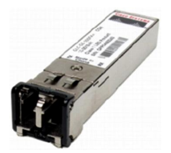
Figure 1. Cisco 100M Ethernet SFP