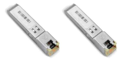
Figure 6. Cisco Copper Gigabit Ethernet SFP

To enable even more cabling flexibility, the Cisco MDS 9000 family offers a copper Gigabit Ethernet SFP. Based on the 1000BASE-T standard, the Cisco Copper Gigabit Ethernet SFP (Figure 5) provides cost-effective connectivity for data center applications. The Cisco Copper Gigabit Ethernet SFP (part number DS-SFP-GE-T) allows a user to use standard Category-5 unshielded twisted pair (UTP) cabling for Ethernet connectivity.