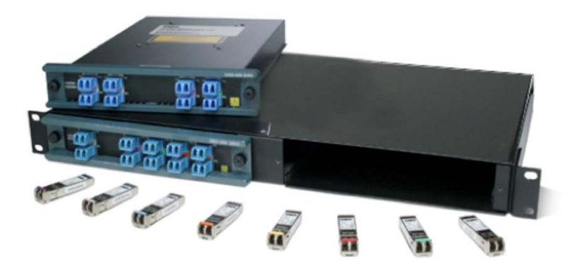
Figure 10. Cisco CWDM Extended Distance SFP Solution

The Cisco CWDM SFP solution enables the transport of up to eight channels over one pair of single-mode fiber strands, enabling enterprises to increase the bandwidth of an existing optical infrastructure without adding new fiber strands. The solution can be used in parallel with other Cisco SFP devices on the same platform.