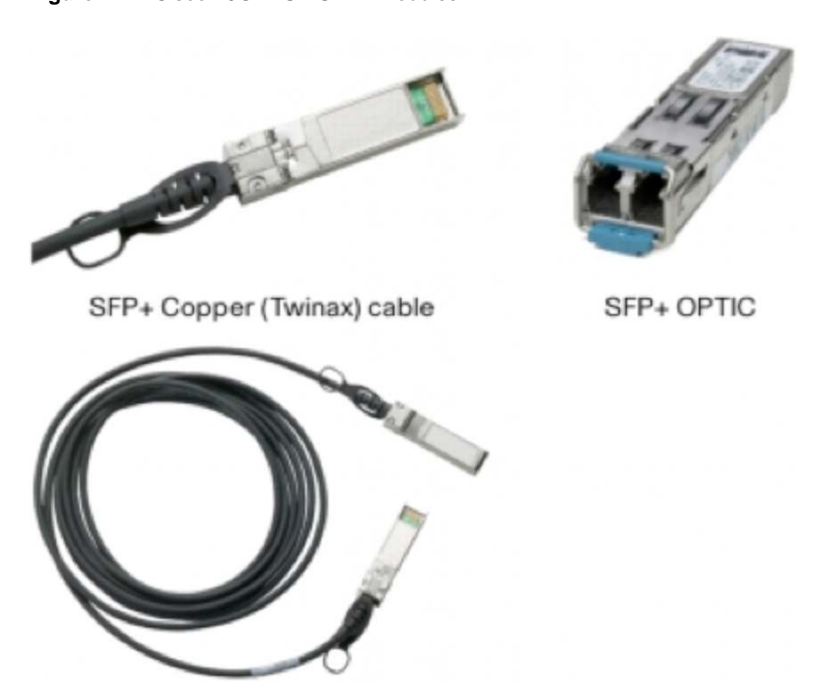
Figure 4. Cisco 10GBASE SFP+ Modules