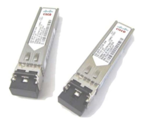
Figure 1. Cisco 2-Gbps Fibre Channel SFPs

The Cisco 2-Gbps Fibre Channel SFPs (Figure 1) are designed to provide cost-effective Fibre Channel connectivity for the Cisco MDS 9000 Fibre Channel switching modules. Two types of Cisco 2-Gbps Fibre Channel SFP are available: the Cisco Fibre Channel Shortwave SFP (part number DS-SFP-FC-2G-SW) and the Cisco Fibre Channel Longwave SFP (part number DS-SFP-FC-2G-LW). Each product offers 1/2-Gbps autosensing Fibre Channel connectivity.