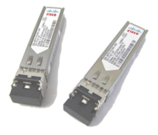
Figure 5. Cisco Tri-Rate Multiprotocol SFPs

There are two types of Cisco Tri-Rate Multiprotocol SFP (Figure 4): the Cisco Tri-Rate Multiprotocol Shortwave SFP (part number DS-SFP-FCGE-SW) and the Cisco Tri-Rate Multiprotocol Longwave SFP (part number DS-SFP-FCGE-LW). Each product offers autosensing 1/2-Gbps Fibre Channel connectivity and 1-Gbps Ethernet connectivity.