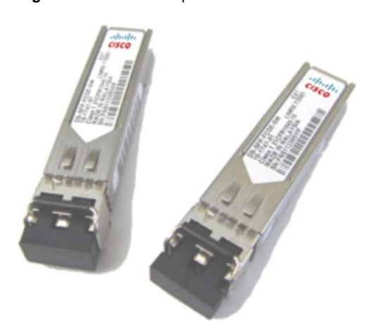
Figure 2. Cisco 4-Gbps Fibre Channel SFPs