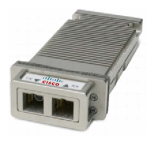
Figure 9. Cisco 10-Gbps Ethernet X2 Transceiver

The Cisco Ethernet X2 Transceiver Short Reach (up to 300 m; part number DS-X2-E10G-SR) enables high-performance Fibre Channel connectivity for the Cisco MDS 9000 family 10-Gbps Fibre Channel switching module to an existing Ethernet Dense Wavelength-Division Multiplexing (DWDM) transponder (Figure 8). The data format transmitted by the Ethernet X2 transceiver (DS-X2-E10G-SR) onto the fiber is identical to that transmitted by the Fibre Channel transceiver (DS-X2-FC10G-SR), except that the Fibre Channel packets are clocked at the 10 gigabit Ethernet rate, which allows Fibre Channel packets to be carried over an existing 10-Gbps Ethernet DWDM infrastructure. The Cisco MDS 9000 family 10-Gbps Fibre Channel switching module will automatically detect DS-X2-E10G-SR; no software configuration is required.