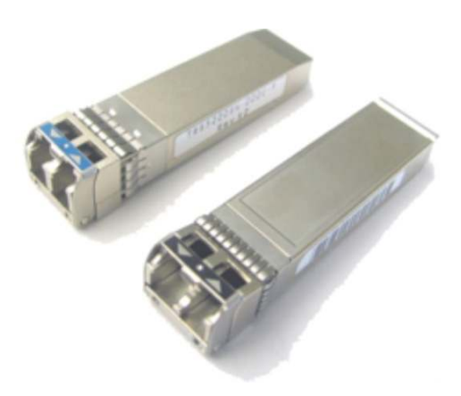
Figure 3. Cisco 8-Gbps Fibre Channel SFP+