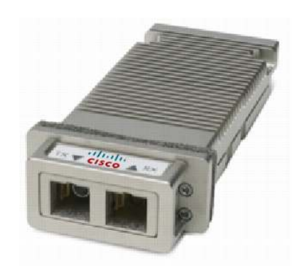
Figure 8. Cisco 10-Gbps Ethernet X2 Transceiver

The Cisco Ethernet X2 Transceiver Short Reach (up to 300 m; part number DS-X2-E10G-SR) enables high-performance Fibre Channel connectivity for the Cisco MDS 9000 family 10-Gbps Fibre Channel switching module to an existing Ethernet Dense Wavelength-Division Multiplexing (DWDM) transponder (Figure 8). The data format transmitted by the Ethernet X2 transceiver (DS-X2-E10G-SR) onto the fiber is identical to that transmitted by the Fibre Channel transceiver (DS-X2-FC10G-SR), except that the Fibre Channel packets are clocked at the 10 gigabit Ethernet rate, which allows Fibre Channel packets to be carried over an existing 10-Gbps Ethernet DWDM infrastructure. The Cisco MDS 9000 family 10-Gbps Fibre Channel switching module will automatically detect DS-X2-E10G-SR; no software configuration is required.