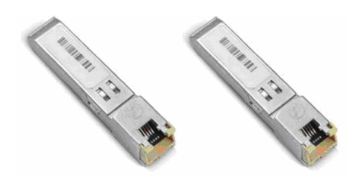
Figure 5. Cisco Copper Gigabit Ethernet SFP

To enable even more cabling flexibility, the Cisco MDS 9000 family offers a copper Gigabit Ethernet SFP. Based on the 1000BASE-T standard, the Cisco Copper Gigabit Ethernet SFP (Figure 5) provides cost-effective connectivity for data center applications. The Cisco Copper Gigabit Ethernet SFP (part number DS-SFP-GE-T) allows a user to use standard Category-5 unshielded twisted pair (UTP) cabling for Ethernet connectivity.