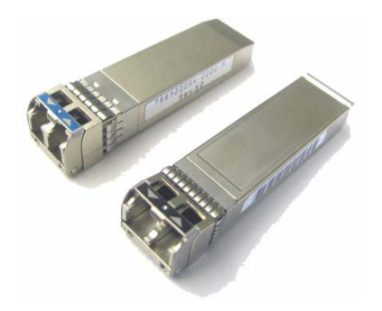
Figure 3. Cisco 8-Gbps Fibre Channel SFP+

The Cisco 8-Gbps Fibre Channel SFP+ (Figure 3) is designed to provide Fibre Channel connectivity for the 2/4/8-Gbps ports on the Cisco MDS 9000 family platform. There are two types of Cisco 8-Gbps Fibre Channel SFP+: the Cisco Fibre Channel Shortwave SFP+ (part number DS-SFP-FC8G-SW) and the Cisco Fibre Channel Longwave SFP+ (part number DS-SFP-FC8G-LW). Each product offers 2/4/8-Gbps autosensing Fibre Channel connectivity.