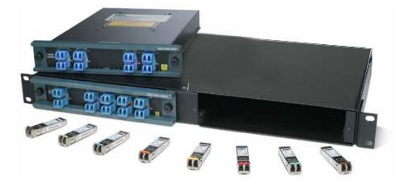
Figure 9. Cisco CWDM Extended Distance SFP Solution

The Cisco CWDM SFP solution enables the transport of up to eight channels over one pair of single-mode fiber strands, enabling enterprises to increase the bandwidth of an existing optical infrastructure without adding new fiber strands. The solution can be used in parallel with other Cisco SFP devices on the same platform.