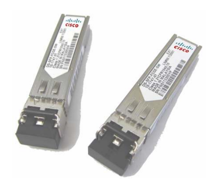
Figure 4. Cisco Tri-Rate Multiprotocol SFPs

There are two types of Cisco Tri-Rate Multiprotocol SFP (Figure 4): the Cisco Tri-Rate Multiprotocol Shortwave SFP (part number DS-SFP-FCGE-SW) and the Cisco Tri-Rate Multiprotocol Longwave SFP (part number DS-SFP-FCGE-LW). Each product offers autosensing 1/2-Gbps Fibre Channel connectivity and 1-Gbps Ethernet connectivity.