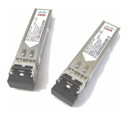
Figure 1. Cisco 2-Gbps Fibre Channel SFPs