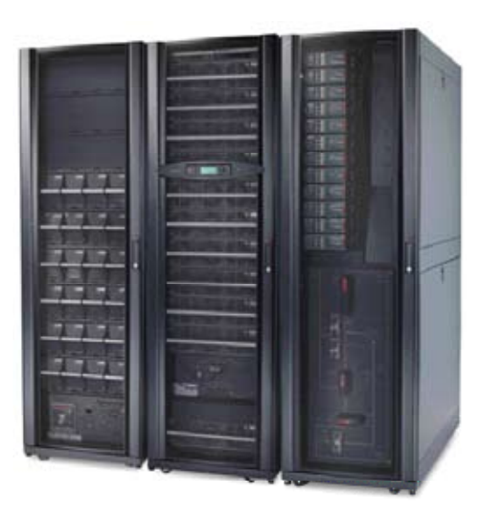
160 kW of protection in three NetShelter enclosures (1.92 m<sup>2</sup>)