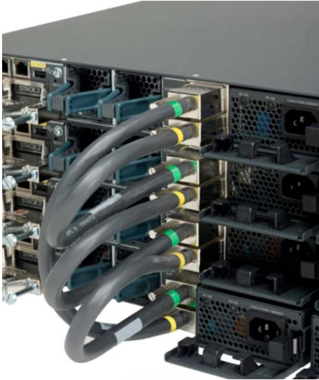
Figure 3. StackPower Connector

StackPower can be deployed in either power sharing mode or redundancy mode. In power sharing mode, the power of all the power supplies in the stack is aggregated and distributed among the switches in the stack. In redundant mode, when the total power budget of the stack is calculated, the wattage of the largest power supply is not included. That power is held in reserve and used to maintain power to switches and attached devices when one power supply fails, enabling the network to operate without interruption. Following the failure of one power supply, the StackPower mode becomes power sharing.