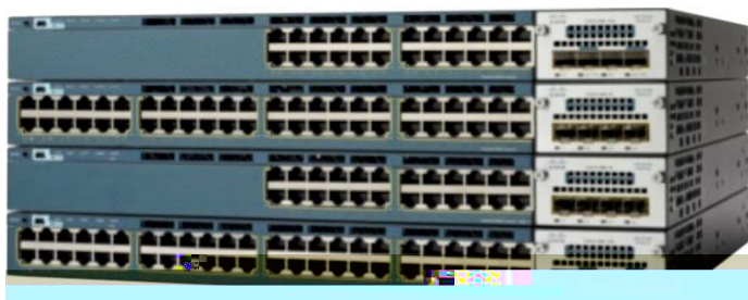
Figure 2. Cisco Catalyst 3560-X Series Switches

Table 2 shows the Cisco Catalyst 3560-X Series configurations.