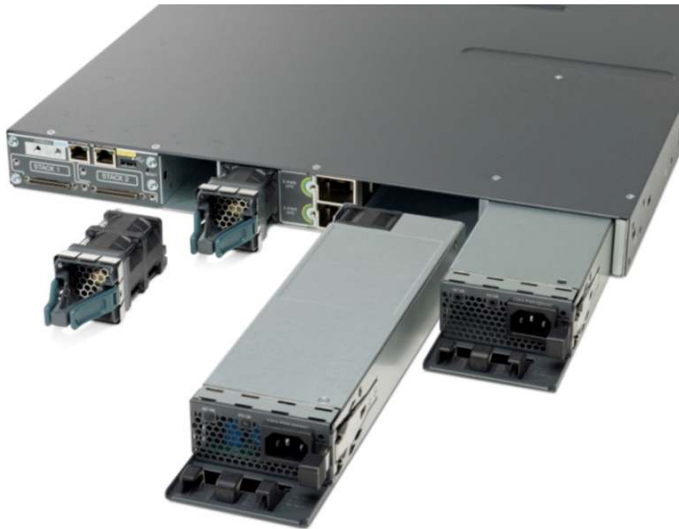
Table 6 shows the different power supplies available in these switches and available PoE power.