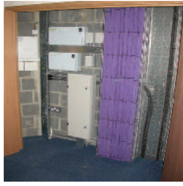
Data cable in tray with power cable running diagonally across the room.

So screening performance can be defined and measured, but what is the limiting factor, below which a cable couldn't be described as screened is not defined. Cable armour is considered as part of the protective earth circuit.