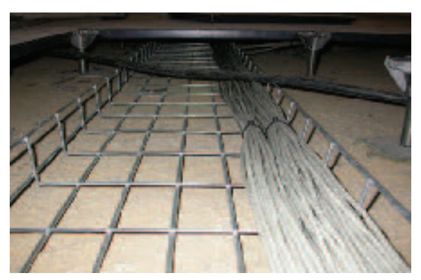
Data cable in tray with power cable running diagonally across the room.

"Two important properties in characterising screening effectiveness of cables are transfer impedance and capacitive coupling (admittance and impedance). These properties can be used to calculate the normalised screening attenuation in dB."